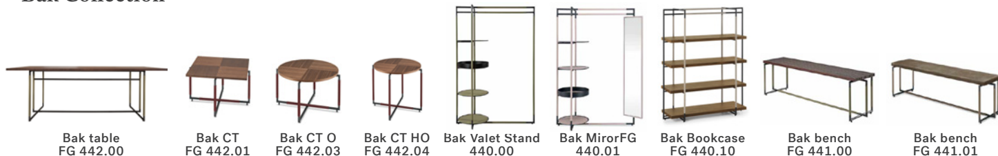
Bak table FG 442.00