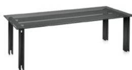
Bridge 270 FG 453.02