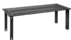
Bridge 240 FG 453.00