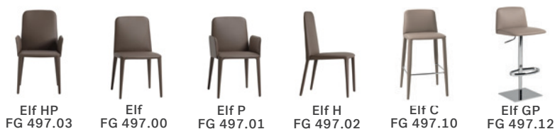
Elf HP FG 497.03