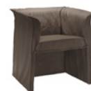
Parentesi FG 422.00