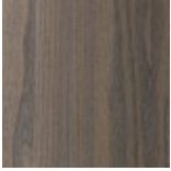
53 Olmo grey