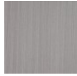
841 Metallic Champagne