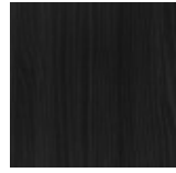
851 Rovere Nero