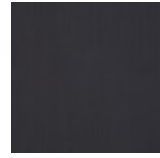
840 Metallic Graphite