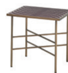
Motif 55 FG 509.00