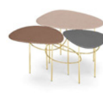
Viae 3 FG 484.01