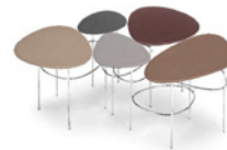
Viae 5 FG 484.00