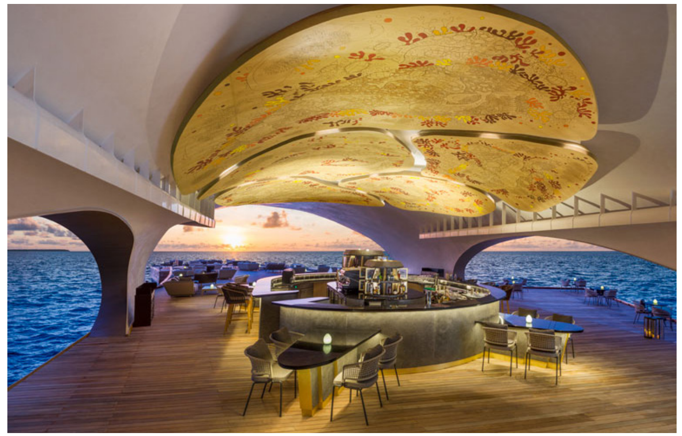
St. Regis Vommuli Resort, Maldives – CTR armchair & clubchair