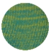
OASE / RAL 5020 ocean blue