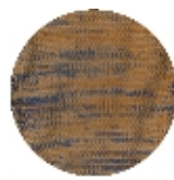
OIL / NCS S5005 Y20R concrete