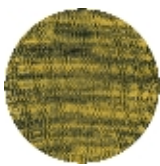
SOLAR / RAL 1005 honey yellow