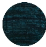
HYDRO / RAL 5020 ocean blue