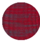
RED AQUATIC / RAL 3009 oxidored