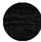
BLACK-GREY / RAL 9005 black