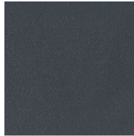
Antrachite Goffrato\ Antrachite Embossed