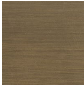
Ottone Brunito\ Bronzed Brass