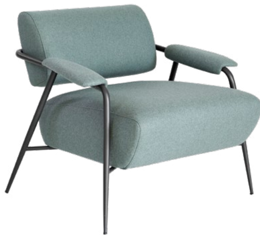
Stay, 909/PL poltrona lounge \ lounge armchair