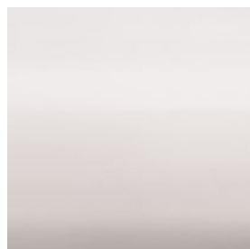
Lucido \ Polished