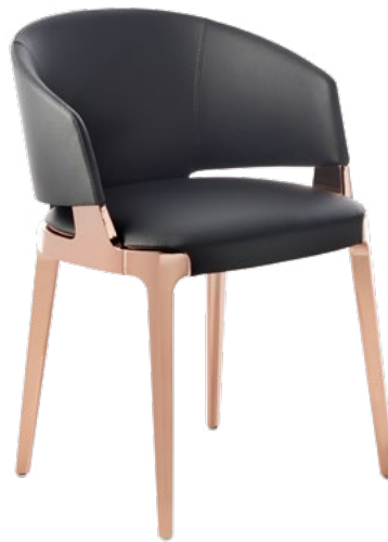
Velissima poltrona pozzetto \ tub armchair