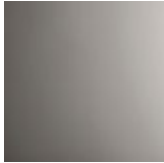
polished stainless steel