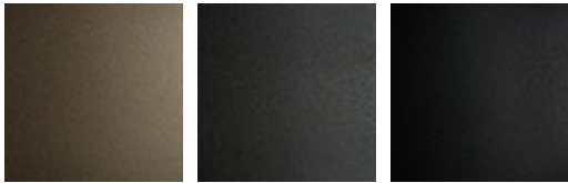
GFM11 titanium embossed