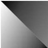
bevelled extra clear