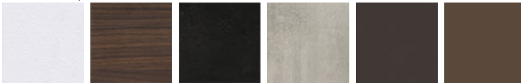
LM02 climb white