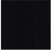
fr73 open pore matt black ashwood