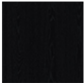
fr73 open pore matt black ashwood