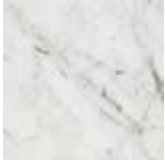
BCO matt white Carrara