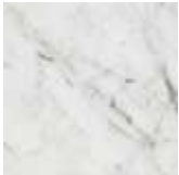
BCO matt white Carrara