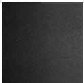
GFM69 graphite embossed