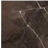
EBO matt Ebano