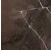
EBO matt Ebano