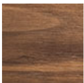
NC walnut canaletto