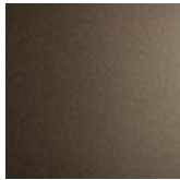
GFM11 titanium embossed