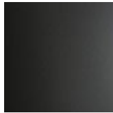
OP69 matt graphite