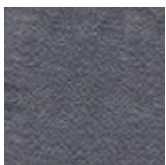
PL73 NERO PERLATO LUCIDO