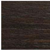
RB burned oak