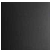
OP69 matt graphite