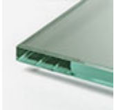
frosted and mirrored