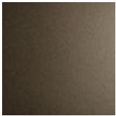
GFM11 titanium embossed