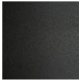
GFM69 graphite embossed