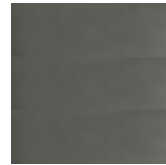
OP0 transparent varnished