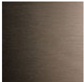
11 satin titanium