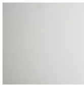
OP71 matt white