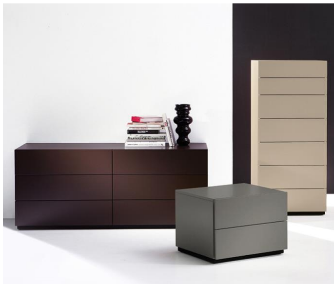
design: Pietro Arosio

Haru is a family of containers with drawers characterized by an extreme formal purity and by an essential line. The only aesthetic grant is a profile placed between the structure and the drawers which can be in the same finish of the drawers or in a different one. Haru collection is also available covered with precious leathers chosen by the client.