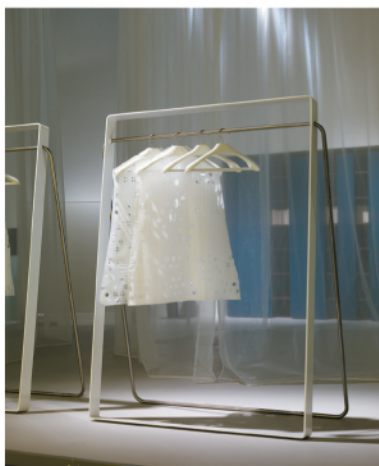
design Duccio Grassi

A practical and elegant clothes hanger which can stand everywhere; it is folding and can be put also in very narrow spaces, in a house, in an office but also in a shop.