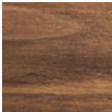
NC walnut canaletto