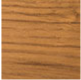
HR Heritage oak