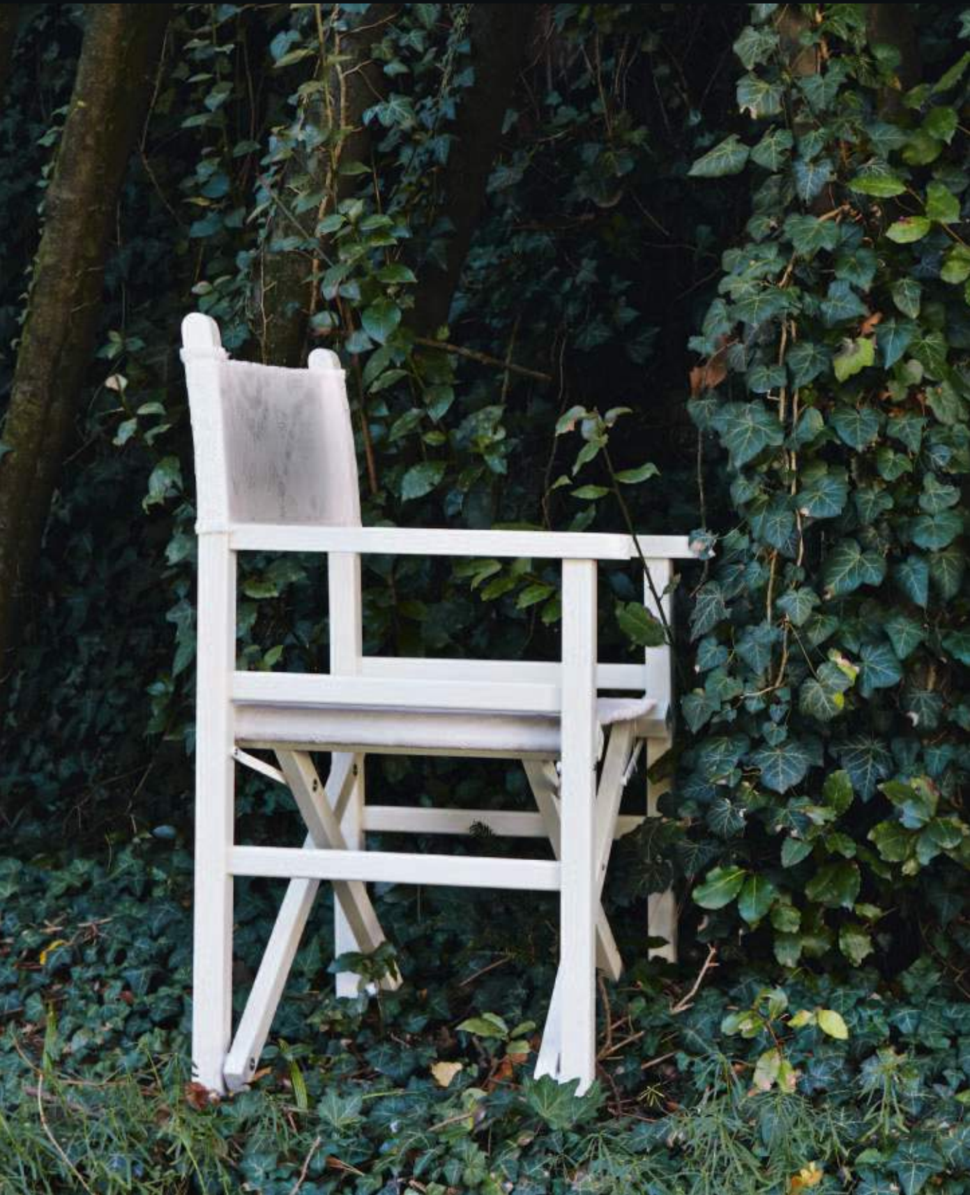
POPPIES FLOWER OUTDOOR