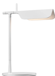
Table lamp. Body in painted pressofused aluminium. Multi-led diffuser in specially designed PMMA to avoid the Multi Shadow effect and dazzle. Head rotation \pm 45^\circ .